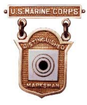
USMC Distinguished Marksman's Badge 1920s - Present

The designation "Distinguished Marksman" originally inscribed on the badge continued until 1959, when the U.S. Army and the DCM (now the CMP) decided to change the terminology to "Distinguished Rifleman." To those wearing the Distinguished Badge in the 1950s, the term "Distinguished Marksman" seemed a bit archaic. In the 1880s, the term "Marksman" conjured up visions of a man or woman especially skilled with a rifle. By the late 1950s the term "Marksman" usually indicated the lowest rung on the weapons qualification ladder following after Expert and Sharpshooter. When the designation was changed, the Army pushed the Adjutant's Shield up on the suspension bar slightly and added "U.S. Army" to the top bar. Aside from the Army inscription on the suspension bar, the Army and the Civilian badge remain identical. The Naval Service (Navy, Marines and Coast Guard), always a vanguard of conservatism, continued to designate their Distinguished Medal winners as "Distinguished Marksmen", a term still inscribed on the badges issued by the Naval Service.