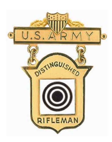
U.S. Army Distinguished Badge 1959 - Present

remember that the 1905 Colt was one of the initial contenders for consideration as the new service weapon prior to John Browning's final refinements. It is at least possible that the artwork for the new E-I-C badge was accomplished prior to final decision of the Ordnance Folks on which new pistol was to receive the nod. Considering the fair resemblance of the 1905 to the M1911, they may simply have decided to leave well enough alone. This is of course, simply speculation, but the pistols on the Marine Corps Leg Medals very closely resemble the 1905 Colt.