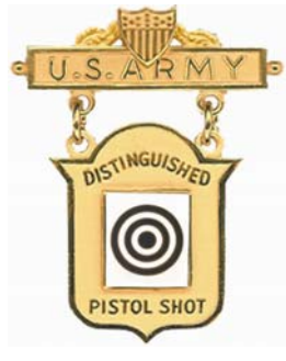
U. S. Army Distinguished Pistol Shot Badge 1959 - Present

While the criteria for selecting Leg Medal winners has changed since the 1880s from a set number of individuals competing in a Departmental or Division Competition,