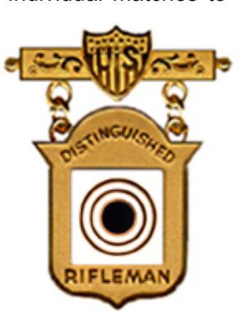
DCM/CMP Distinguished Badge 1959 - Present

National Guard teams and individuals until 1923, when civilians who were already "leg medal holders" from their service days were allowed to continue to compete until they became Distinguished Marksmen or Distinguished Pistol Shots. A wise Congress opened the National Trophy Matches to civilians in 1926 with an eye toward preparing the citizenry for service in times of national emergency, a policy that served the country well through the Vietnam War.