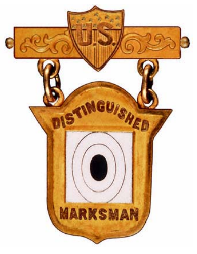
The First Distinguished Badge 1887 – 1903